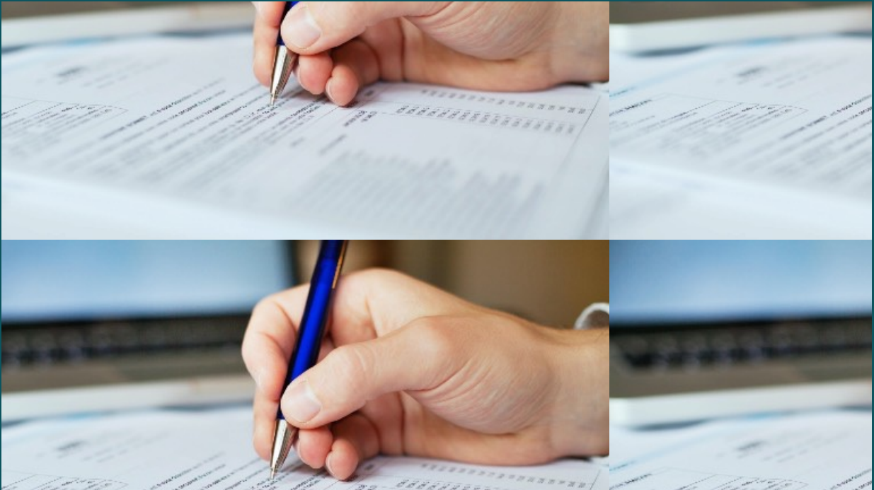
State Tax Deadlines Extended MARCH 30, 2020