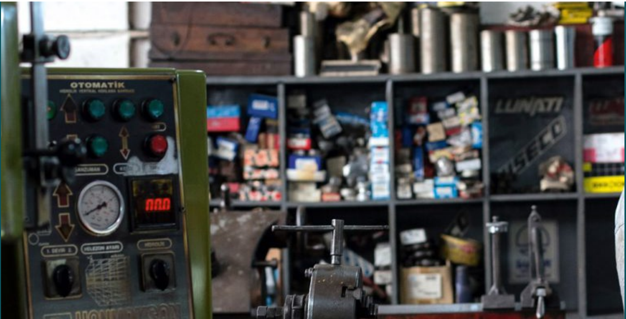
GOED Launches Plan to Offer Assistance to Small Businesses – Utah Leads Together Small Bu... MARCH 30, 2020